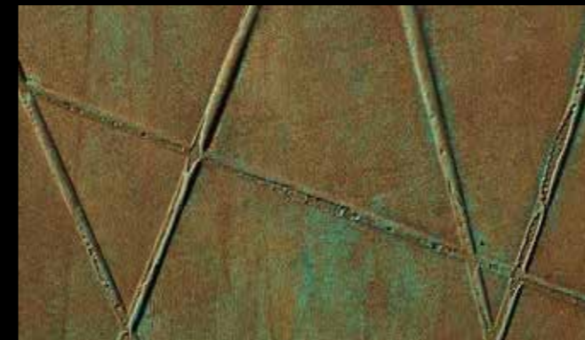
Spider Copper 1020