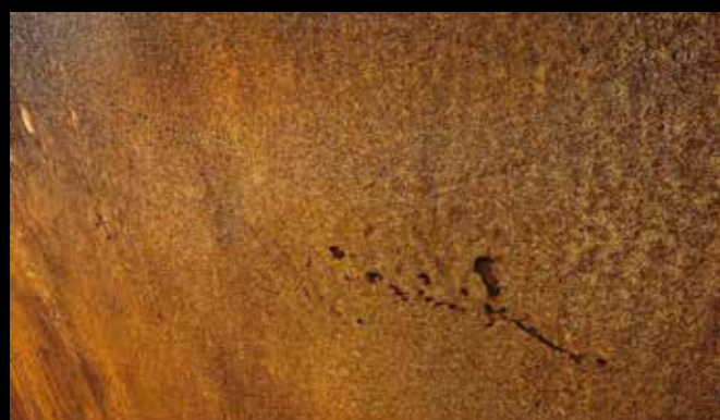
Flat Rust 1012