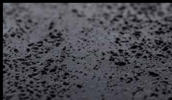
Travertine Black 1085