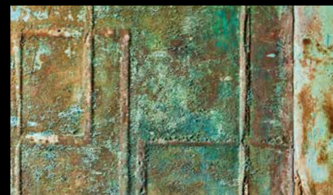
Square Copper 1021