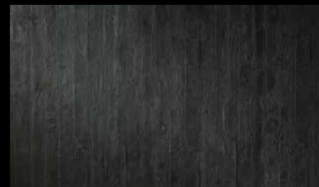
Fireplank Mokutan 1017