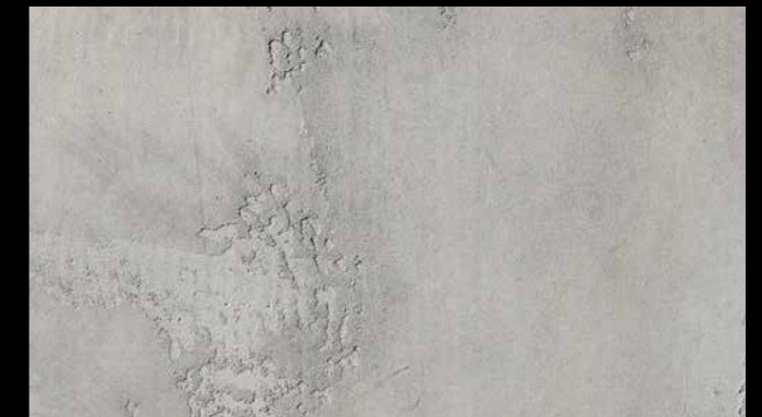
Concrete Trash - Light 1015