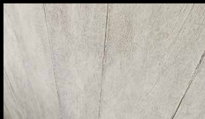
Wood Optic 1007