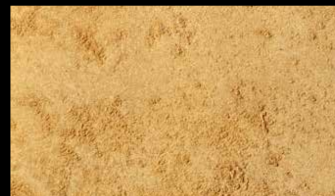
Travertine Beige 1089