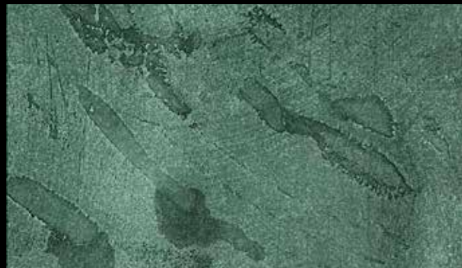
Loft Green 1008