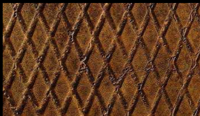
Waffle Rust 1011