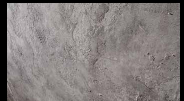
Concrete Trash - Dark 1023