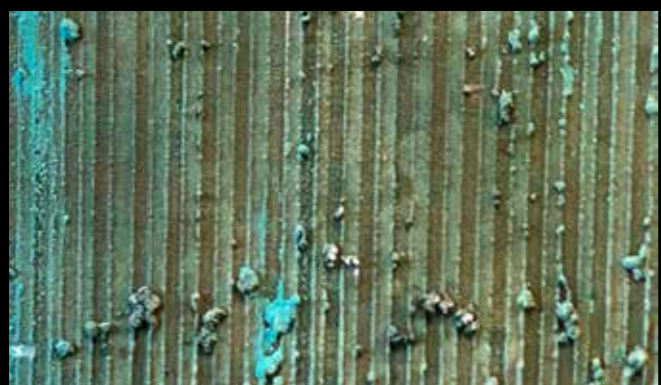
Highrise Copper 1024