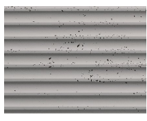
TX-075 7044 Wave