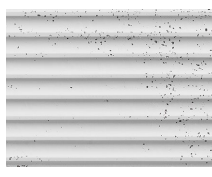
TX-075 9016 Wave