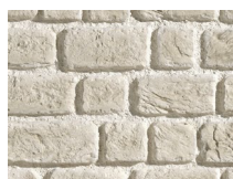
PX-185 Wall Brick Titanio