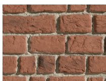
PX-183 Wall Brick Red Cassel