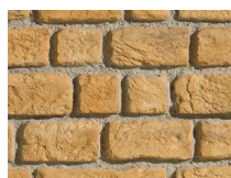
PX-184 Wall Brick Ocre