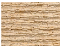
PX-060 Laja Valladolid Ocre