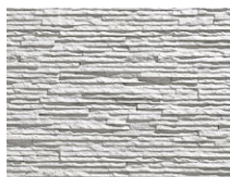
PX-060 9016 Laja Valladolid Blanco