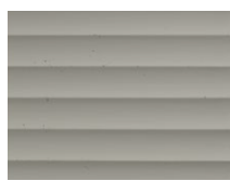
PX-143 7030 Tiffany