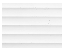
PX-143 9003 Tiffany