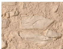
PX-077 Segovia Tierra