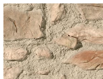
PX-078 Segovia Gris Musgo