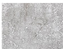
TX-037 Rough Beton Envejecido