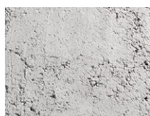
TX-019 2502 Rough Beton