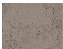
TX-019 Rough Beton