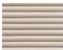
PX-210 Roble Blanco Envejecido