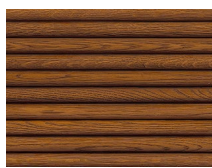
PX-208 Roble Nogal Oscuro