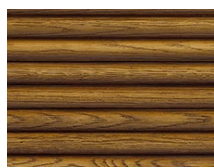
PX-207 Roble Nogal Claro