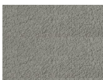
PX-134 7030 Proyectado