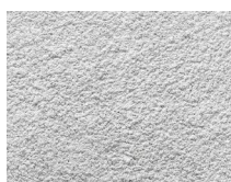
PX-134 9016 Proyectado