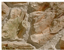
PX-079 Oviedo Gris Musgo