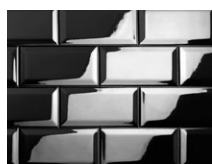
PX-149 NGR B Metro