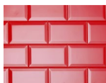
PX-149 3002 Metro