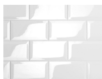
PX-149 9003 Metro