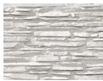
PX-082 9016 Laja Pirineos Blanco