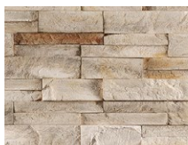
PX-087 Laja Castilla