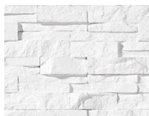
PX-087 9016 Laja Castilla