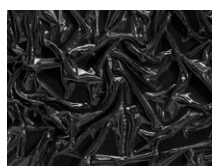
T-001 9005 Kioto