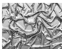
T-001 PLATA Kioto