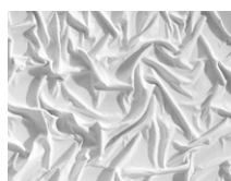
T-001 9016 Kioto