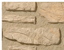
PX-047 Galicia Blanco