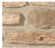
PX-076 Galicia Gris Musgo