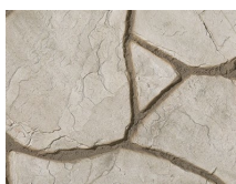
PX-190 Flat Stones