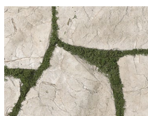
PX-190 MOSS Flat Stone Moss