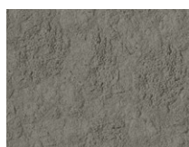
TX-010 7039 Etna