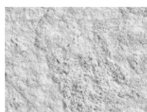
TX-010 9016 Etna