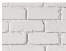
PX-147 9016 English Brick