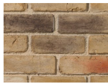
PX-148 English Brick Marrón