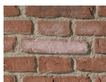
PX-151 BL Country Brick BL