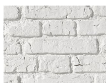
PX-120 KFC Country Brick