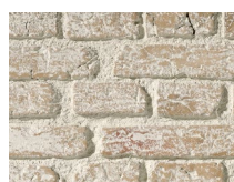
PX-145 Country Brick Marrón Envejecido