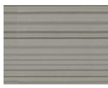
PX-141 7030 Cortina