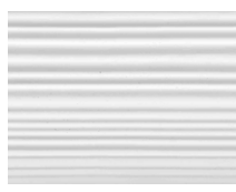
PX-141 9003 Cortina