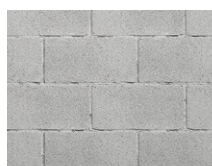
TX-125 7030 Bloque Hormigón