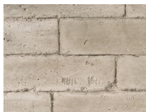
PX-195 Block Brick Titanio