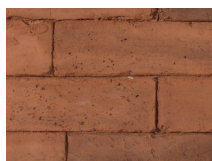
PX-194 Block Brick