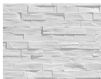
PX-081 9016 Aragón