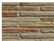
PX-069 Aldaia Gris Rojizo