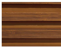
PX-212 Abeto Nogal Oscuro