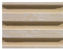
PX-214 Abeto Blanco Envejecido