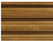
PX-211 Abeto Nogal Claro