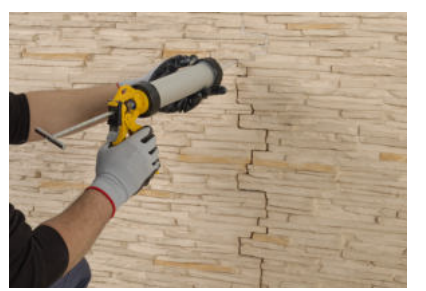
Cover with putty the holes of the screws and the joint between the panels.