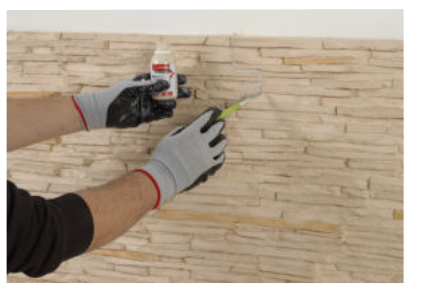
Let the putty dry for approximately 24 hours (this time will depend on the room temperature) and touch up the joints and holes where the putty has been applied with Panespol touch-up paint.