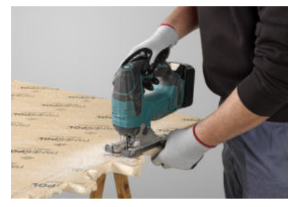
With a jigsaw cut the ends of the panel to begin the assembly at one end of the wall.