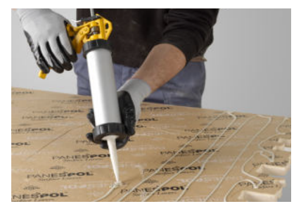
Apply the adhesive on the back of the panel creating a bead. Attention: consult in case of outdoor installation as a specific adhesive will be used.