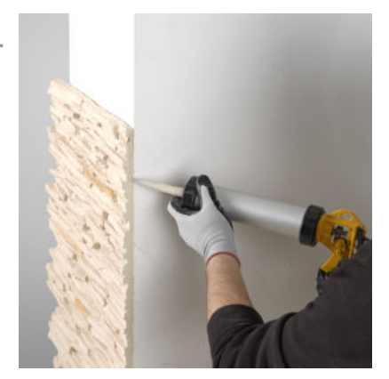
Once the first piece of the corner is placed, apply a bead of adhesive to the mitre and place the other piece. The joint needs to be tight together so that it presses the adhesive.