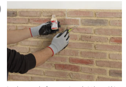
Let the putty dry for approximately 24 hours (this time will depend on the room temperature) and touch up the joints and holes where the putty has been applied with Panespol joint paint.