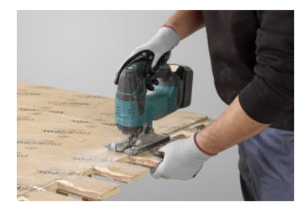
With a jigsaw cut the ends of the panel to begin the assembly at one end of the wall.