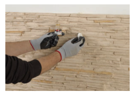
Finally, with the help of a fine brush or cloth, touch up the panels with dry-applied pigment powder until the desired result is obtained.