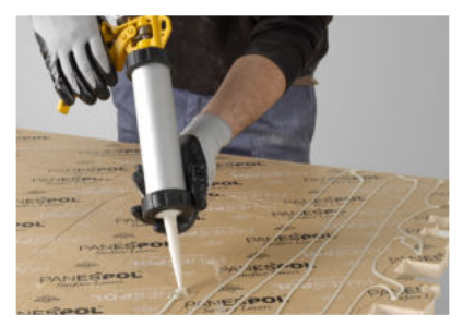
Apply the adhesive on the back of the panel creating a bead. Attention: consult in case of outdoor installation as a specific adhesive will be