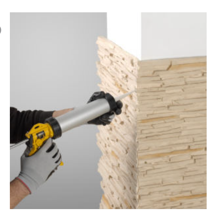
Once all the panels are assembled, cover with putty the holes of the screws and the joint between the panels.