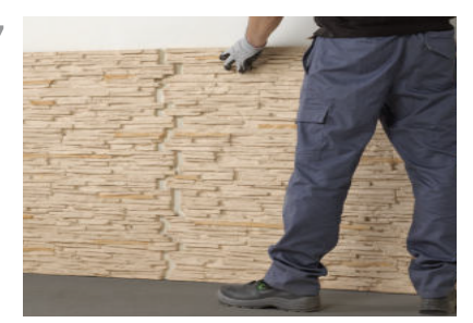
Place the next panel, which thanks to its shape will fit perfectly.