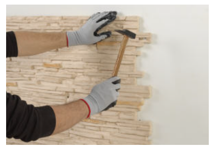
Prepare screws inside plugs previously and introduce them into the holes made in the panel and wall with the help of a hammer. Next, screw until the screw is inserted without going through the panel. We recommend screwing the entire perimeter and the entral part. (Use about a dozen screws per m2, double for outdoor applications.)