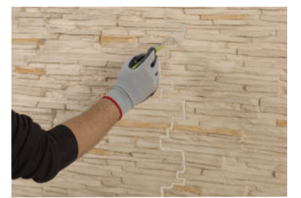
Spread the putty with the help of a brush giving it the appropriate shape all along the joint.