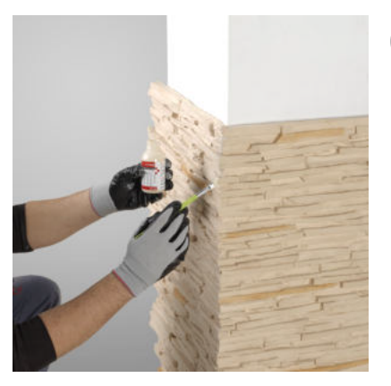
Let the putty dry for approximately 24 hours (this time will depend on the room temperature) and touch up the stones and bricks, where necessary, with Panespol touch-up paint. Once this paint is dry, finish the joints area with Panespol touch-up paint for the joints.