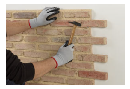
Prepare screws inside plugs previously and introduce them into the holes made in the panel and wall with the help of a hammer. Next, screw until the screw is inserted without going through the panel. We recommend screwing the entire perimeter and the central part. (Use about a dozen screws per m2, double for outdoor applications.)