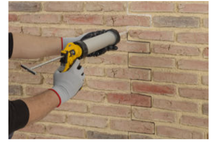
Cover with putty the holes of the screws and the joint between the panels.