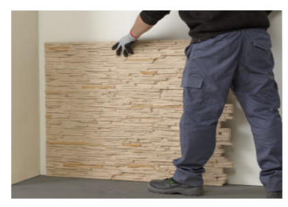
Place the panel on the wall and begin with its fixation.