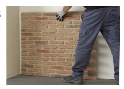
Place the panel on the wall and begin with its fixation.