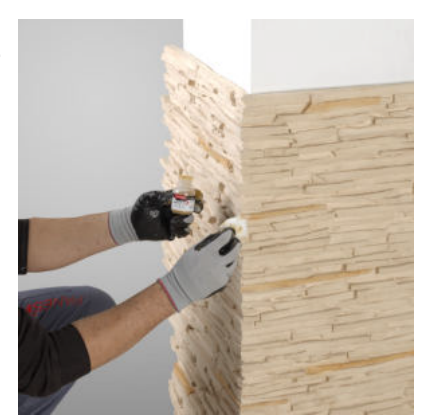
Finally, with the help of a fine brush or cloth, touch up the panels with the pigment applied dry until the desired result is obtained.