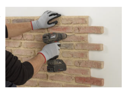
Drill panel and wall simultaneously. Make these holes in the areas of the joints, since later the retouching will be easier to carry out.