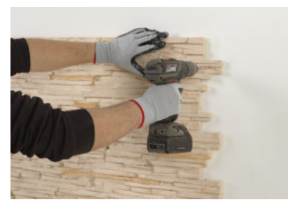
Drill panel and wall simultaneously.