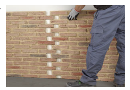
Place the next panel, which thanks to its shape will fit perfectly.