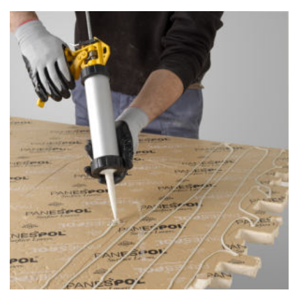
Once each part of the panel has been cut at 45°, apply the adhesive on the back of the panel creating a bead. Attention: consult in case of outdoor installation as a specific adhesive will be used.