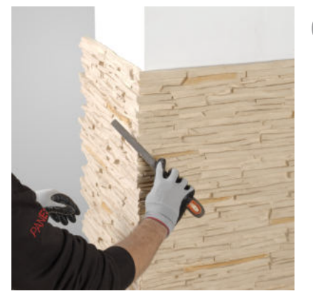
Screw together the two pieces that cover the corner with 2 or 3 screws (depending on the height). Spread the adhesive with the help of a brush shaping it to the panel. Then screw the second piece of the corner to the wall. If necessary, file the irregularities of the angle.