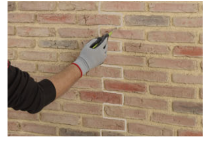
Spread the putty with the help of a brush giving it the appropriate shape all along the joint.