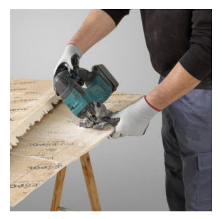
Place the panel on the corner and draw a line on the back of the panel that will be used to make the miter cut. Cut the panel at 45° with a jigsaw following the line previously marked.